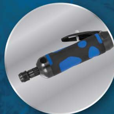
ATA SMD25LR Die Grinder