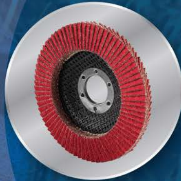
ATA Garryson CeramIQ™ Flap Discs