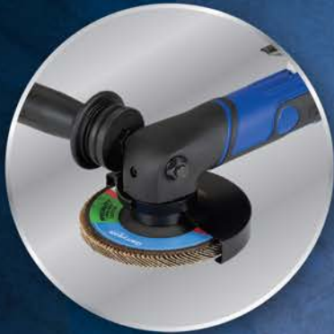
ATA RA1650 Angle Grinder

ATA Tools and consumables specifically designed for heavy duty grinding applications