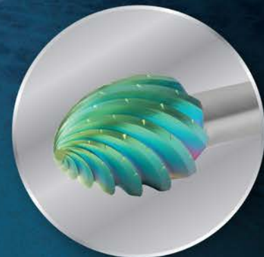
NEXT GENERATION 6 Bur